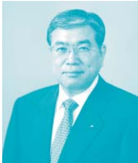
Yuji Samaru President

To step up our efforts in disaster prevention areas, such as liquefaction prevention and port and embankment reinforcement. In addition, to expand activities in the contaminated soil stabilization