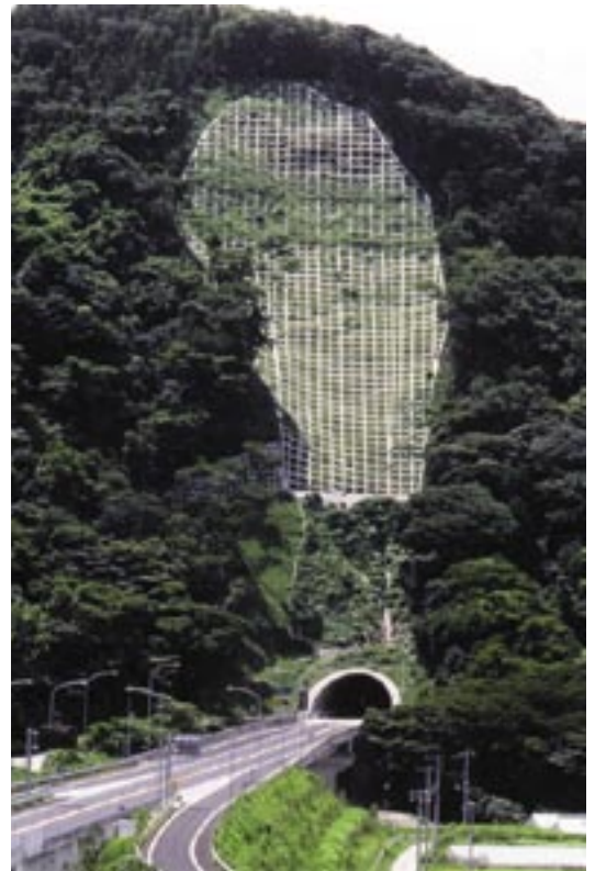
Fig. 7: After installation