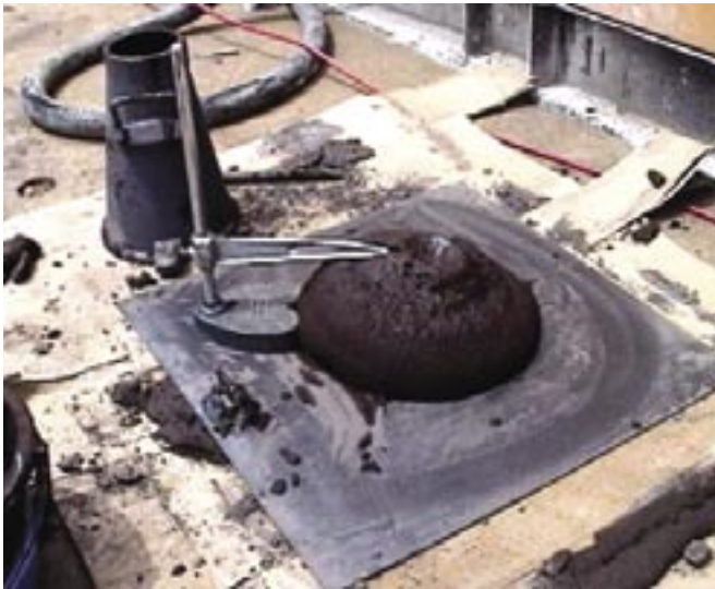
Fig. 9: Slump measurement

During Grid Beam construction, 33 sampling boxes were prepared in the same way as used for the Grid Beams by shotcreting into a box made of the same steel mesh formwork as shown in Fig. 12. Six test pieces were cored from each sampling box. Unconfined compressive strength tests were performed on three cores at 7 days and the other three at 28 days after sampling box preparation and the results were averaged respectively. The average unconfined compressive strength of all the cores at 28 days was 5018 psi (34.6 MPa), which well exceeded the design strength of 3480 psi (24 MPa), with a coefficient of variation of 8.2% (see Fig. 13).