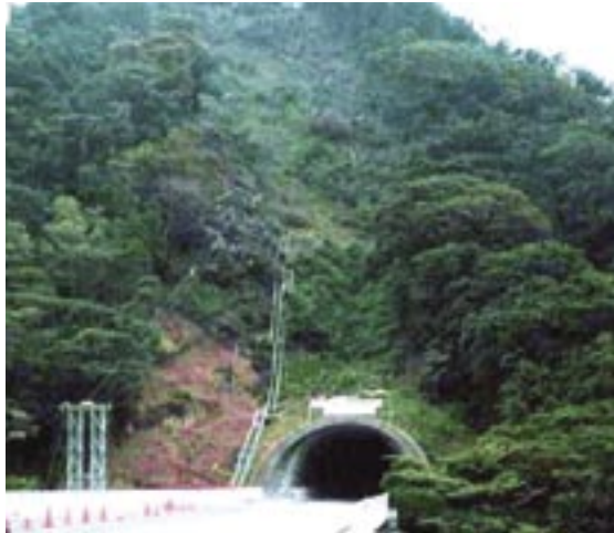
Fig. 6: Before installation

thickening agent were added and mixed with portland cement and fine aggregate in a truck mixer. After mixing, materials were delivered to the spray nozzle on the slope using a piston pump and were sprayed