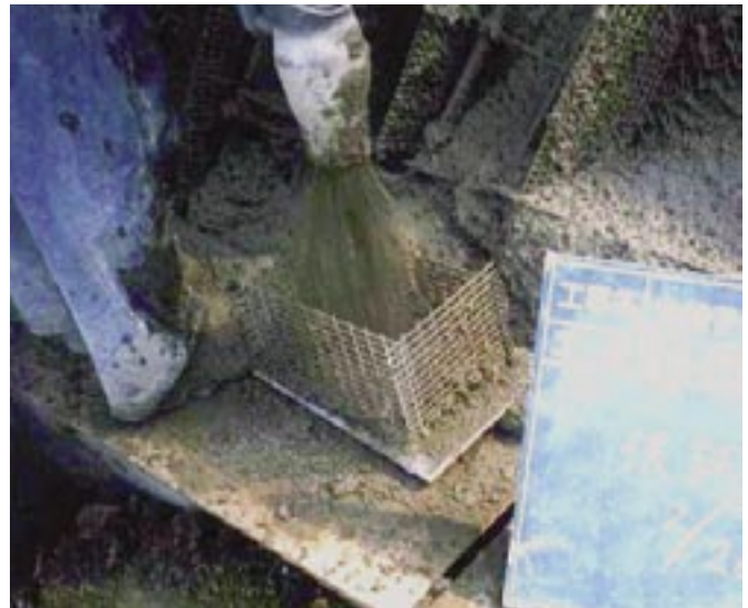
Fig. 12: Sampling box made of steel mesh formwork