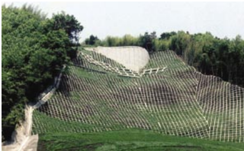
Fig. 1: Grid Beam system of harmonizing with the surrounding environment

Portland cement-based mortar is generally used for shotcrete in Japan. Wet-mix shotcrete is predominantly used because of its homogeneity in quality and high work efficiency. The standard design strength of Grid Beam shotcrete is normally in the range of 2175 to 3480 psi (15 to 24 MPa), slightly less than the requirements for shotcrete in western countries.