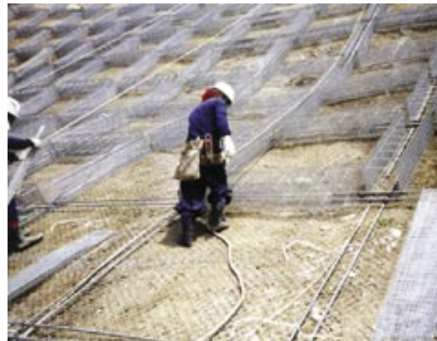
Fig. 2: Installation of Grid Beam formworks