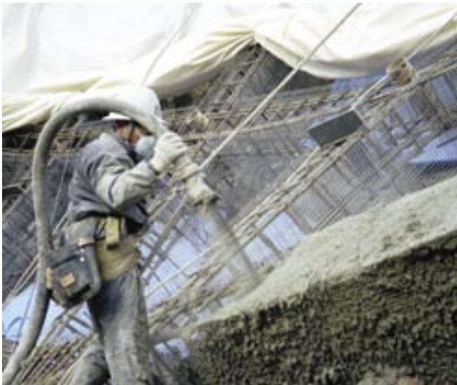
Fig. 10: Shotcrete work in progress