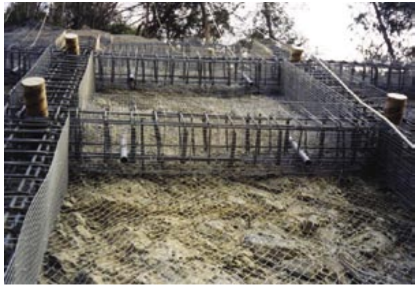
Fig. 3: Guide pipes are installed

A shallow sliding failure was anticipated above a tunnel portal on the Tateyama Highway, located in a suburb of Tokyo. Therefore the target area was cut and reshaped in advance and stabilized by the Grid Beam system together with soil nail installation (see Fig. 6 and 7). At intersections of the concrete Grid Beams, 1157 pieces of soil nail 1 in. (25 mm) in diameter and 16 1 ft (5.0 m) long were installed to cover the target area of 5442 yd 2 (4550 m 2 ). The dimension of the Grid Beam cross section was 12 x 12 in. (300 x 300 mm) with reinforcement of 4 steel reinforcing bars of a diameter 0.6 in. (16 mm). The standard spacing between two parallel beams was 6.7 ft (2.0 m). A 20 in. (50 cm) thick plant base layer was installed inside the beam frame using the same shotcrete equipment. The total piping length from the plant to the spray location was 722 ft (220 m) with a vertical interval of 427 ft (130 m). The required unconfined compressive strength of the shotcrete was 3480 psi (24 MPa). The biggest challenge of this site was to pump materials over a long distance without losing suitable plastic properties for shotcrete