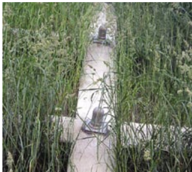
Fig. 5: Grid Beam covered with grasses