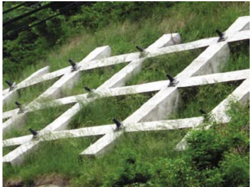
Fig. 4: Anchor heads and Grid Beam