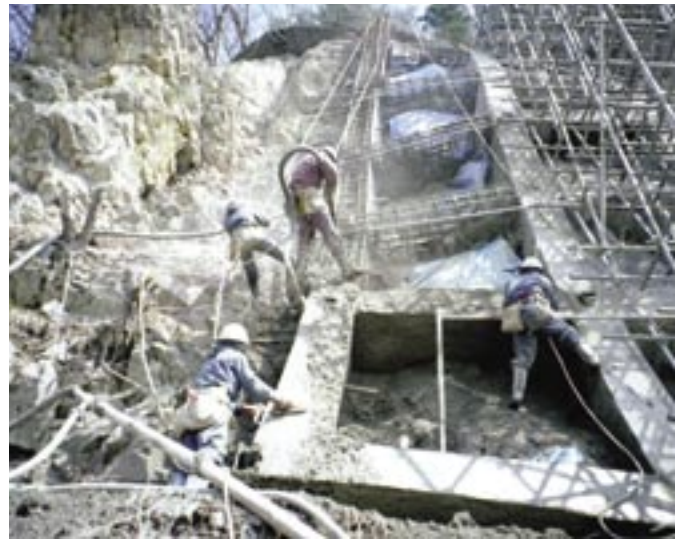
Fig. 11: Surface finishing in progress